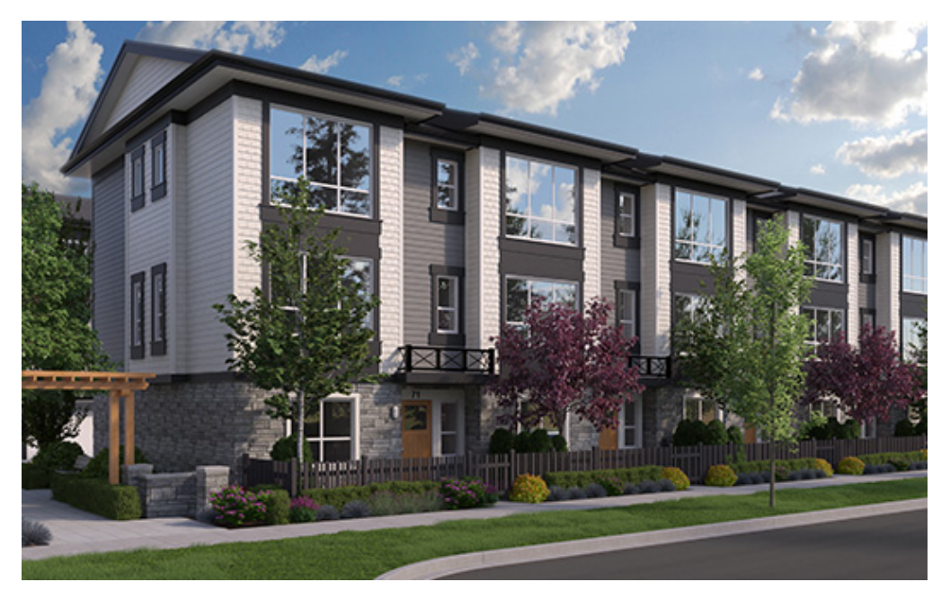
THE ENERGY STEP CODE COUNCIL

As of May 1, 2023, the BC Building Code (the Code) requires 20%-better energy efficiency for most new buildings in B.C. This is equivalent to Step 3 for Part 9 buildings and Step 2 for Part 3 buildings. A new Zero Carbon Step Code provides tools to local governments to incentivize or require cleaner new construction. This is a significant milestone in B.C.'s transition towards energy efficient and zero carbon new buildings. Upper Steps are still available for local government opt-in. This website will be further updated to reflect these changes. Learn more about the new building code requirements. (https://energystepcode.ca/requirements/#bcbc-2018-rev-5)