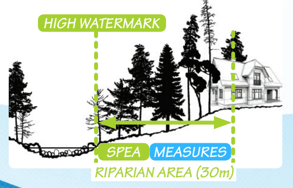
DIAGRAM 1: Illustration of the 30m Riparian Assessment Area requiring compliance with the Riparian Areas Regulation.

Qualified Environmental Professionals (QEPs) include agrologists, biologists, foresters, geoscientists, and technologists who are in good standing with their respective professional organizations working in their area of expertise.